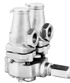
Dual Valve with Manifold